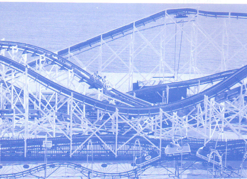
The fully restored coaster with an original car thrilling a new generation of riders.

After many years of ups and downs the oldest touring roller coaster in the world has opened at its new home.