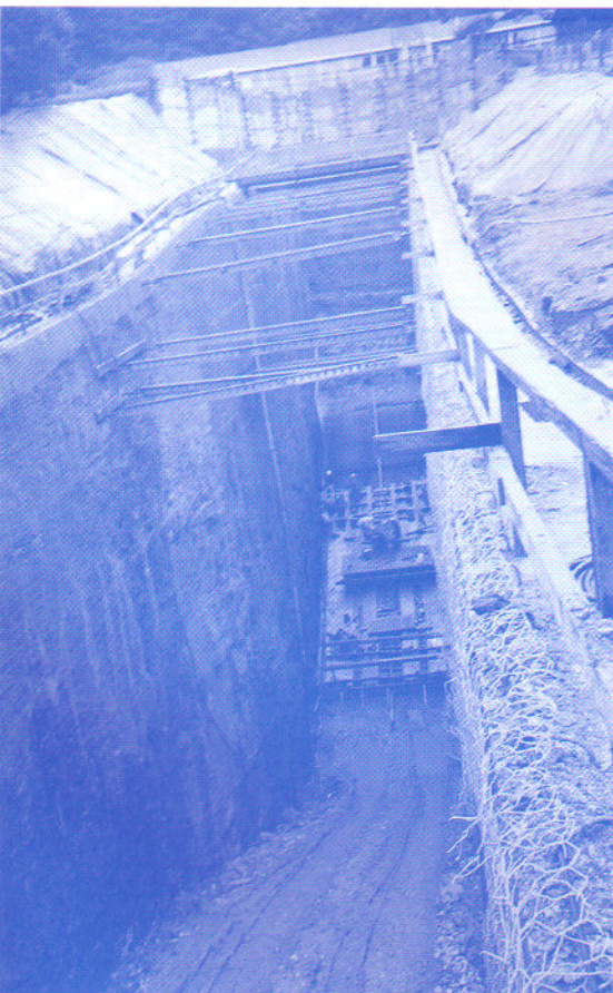
It's a long way down, but what is it?