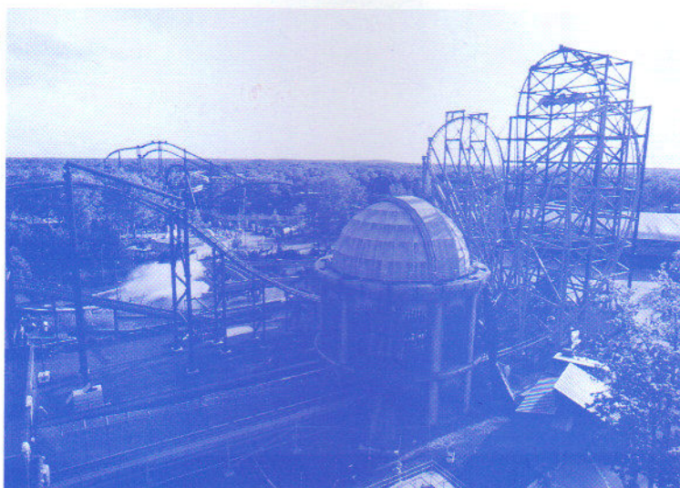
Batman & Robin: The Chiller

☺ A new 50 acre movie based theme park is to open in the city of Bocaue in the Philippines. The park, currently named Movieland will be a cross between the Universal/MGM style parks and genuine ride based parks like Six Flags. There will be a number of themed areas dedicated to a specific genre of film, reflected by the nature of rides in that area.